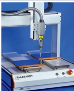
Nozzle with xy-table