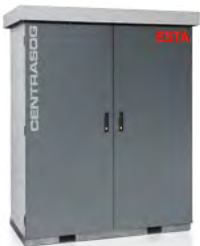
CENTRASOG CVS 2.0