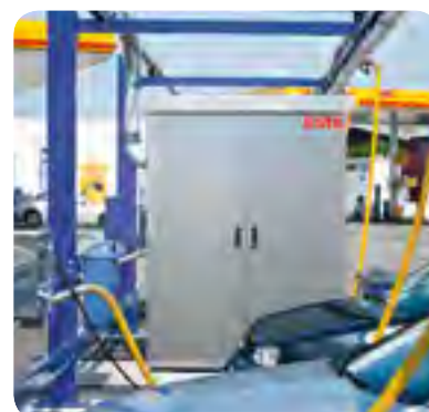
Weather-resistant housing for outdoor installation