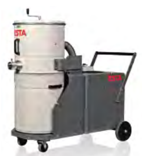
High vacuum WHISPERSOG